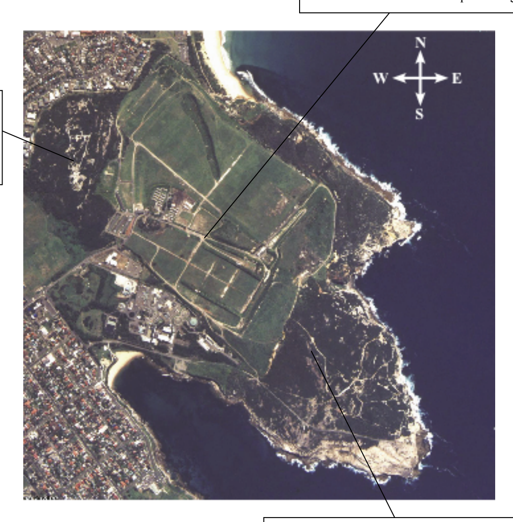
Block 2: A Heritage Area containing disused defence installations and important remnants of native coastal vegetation.